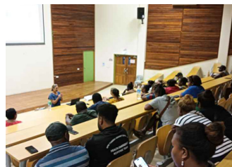
Pacific Engagement Visa information session at the Solomon Islands National University, SINU.

The Pacific Engagement Visa (PEV) is a landmark initiative that will enhance Australia and Solomon Islands' relationship, strengthen people-to-people links and encourage greater cultural, business and education exchange.