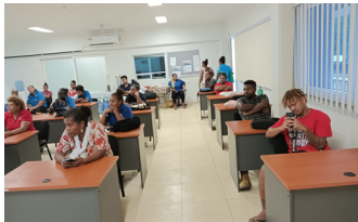
Pacific Engagement Visa information session with APTC students

I have, however, heard from many Solomon Islanders they would like to see further opportunities to connect with Australia.